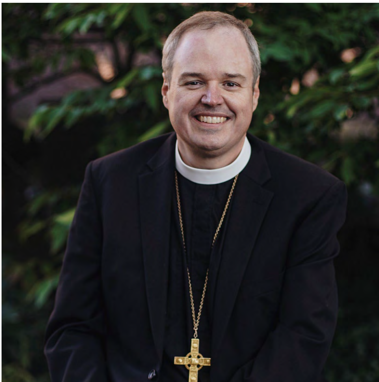
The Rt. Rev. Sean Rowe Presiding Bishop-Elect